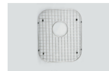
Grid Model: G207047

Bosco Canada Inc. is known around the world for producing high quality kitchen sinks that incorporate modern design and functional superiority in every piece they manufacture.