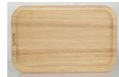
Cutting Board Model: 202009