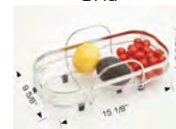
Model: 202014 Basket