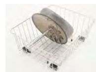
Model: 202013 Plate Holder