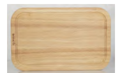
Model: 202009 Cutting Board

Bosco Canada Inc. is known around the world for producing high quality kitchen sinks that incorporate modern design and functional superiority in every piece they manufacture.