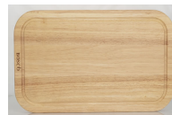
Model: 202009 Cutting Board

Bosco Canada Inc. is known around the world for producing high quality kitchen sinks that incorporate modern design and functional superiority in every piece they manufacture.