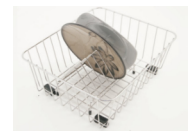
Model: 202013 Plate Holder

Bosco Canada Inc. is known around the world for producing high quality kitchen sinks that incorporate modern design and functional superiority in every piece they manufacture.