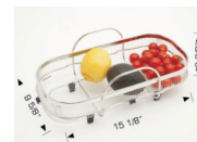
Model: 202014 Basket