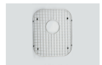
Model: GHU207007 Grid