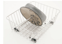
Plate Holder Model: 202013