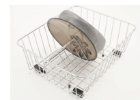
Model: 202013 Plate Holder