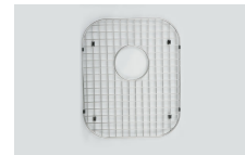
Model: G207030 Grid

Bosco Canada Inc. is known around the world for producing high quality kitchen sinks that incorporate modern design and functional superiority in every piece they manufacture.