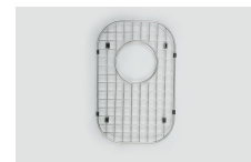
Model: G207029 Grid

Bosco Canada Inc. is known around the world for producing high quality kitchen sinks that incorporate modern design and functional superiority in every piece they manufacture.