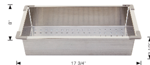
Model: 202040 Colander