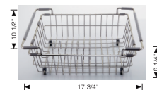
Model: 202041 Plate Holder