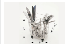
Model: 202015 Utensil Rack