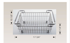
Model: 202041 Plate Holder

Bosco Canada Inc. is known around the world for producing high quality kitchen sinks that incorporate modern design and functional superiority in every piece they manufacture.