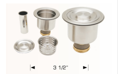
Model: 202012 Grid