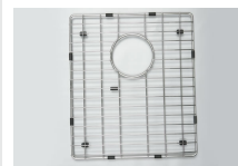
Model: G203311 Grid