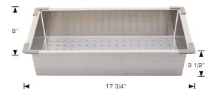
Colander Model: 202040