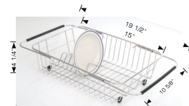
Plate Holder Model: 202041