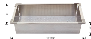
Colander Model: 202040

Bosco Canada Inc. is known around the world for producing high quality kitchen sinks that incorporate modern design and functional superiority in every piece they manufacture.