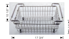
Plate Holder Model: 202041